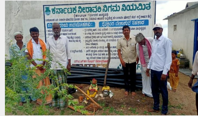
School Compound Wall & Soak Pit construction