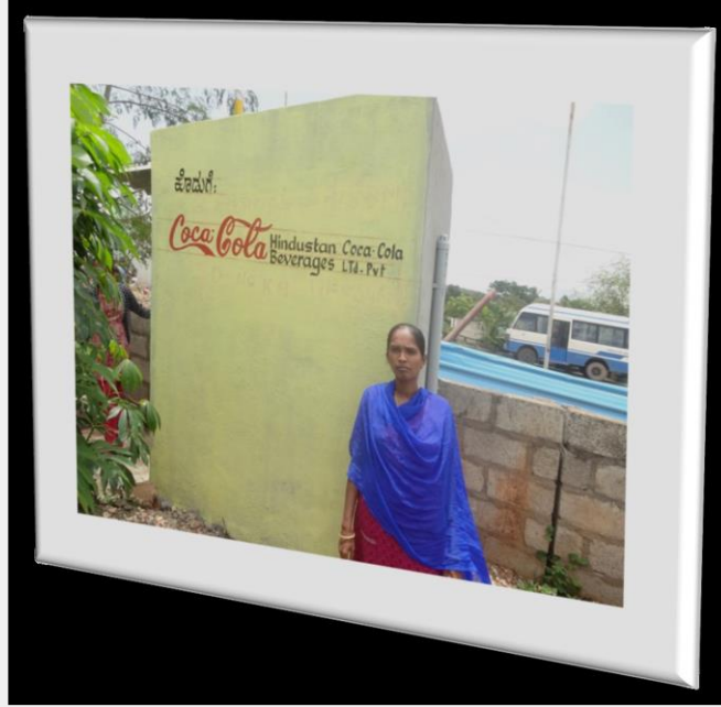
House Hold Sanitation Unit