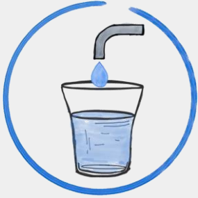
Safe drinking water