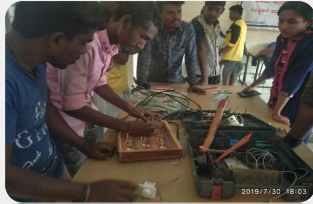
IFS & Electrical Training