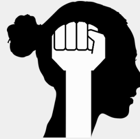
Women empowerment & Livelihood income generation