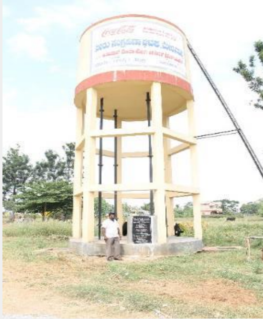
Over head Tank