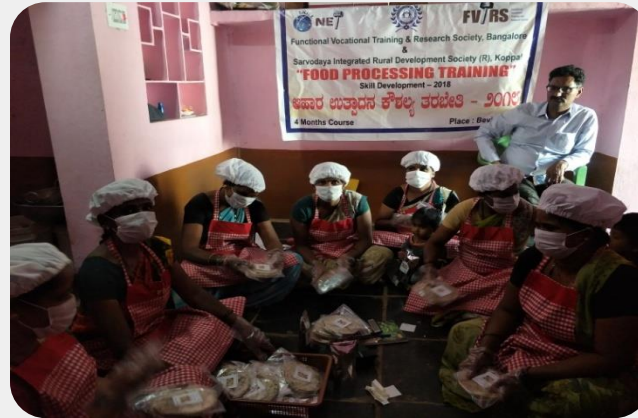
Food processing unit in action