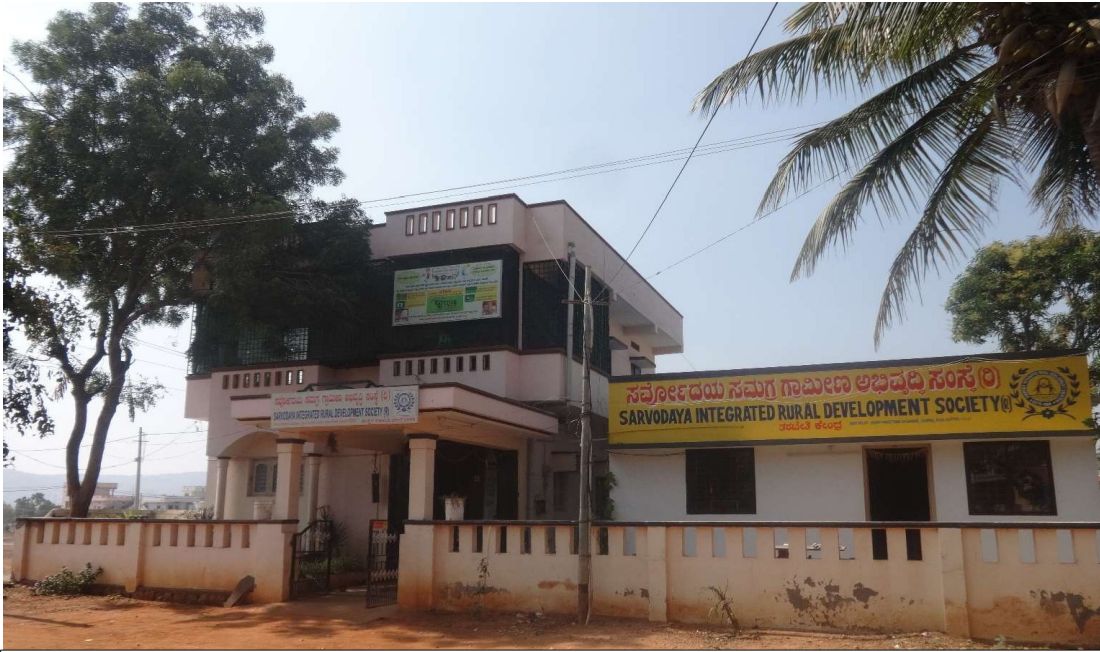
Sarvodaya Integrated Rural Development Society BSNL Colony, Opp. Teachers colony, Kinnal Road Koppal 583 231

across the state. Though it began its operations working with the mentally challenged, it now has spread its scope of work to education, Child rights, Health, Water conservation, sanitation, safe drinking water, livelihood training and farming community. Various projects have been completed under these subjects thus reaching out thousands of needy in collaboration with government machinery, private institutions and partnering with corporate houses. We are looking forward for new challenges and new missions where in our 20 plus years of experience in the field of development that could be a great asset to reach out many more thousands in the years to come.