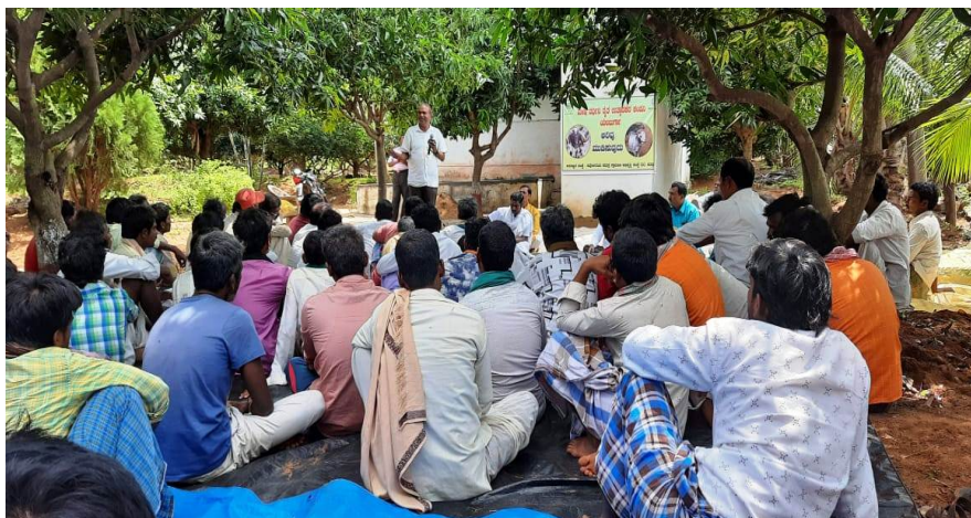
Vermicompost pit constructed through Battadanadu FPO